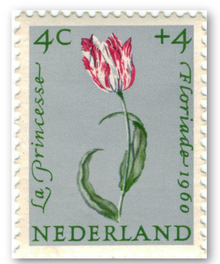
One of the most sought-after tulips was the "Semper Augustus", which no longer exists, but looked like the tulip depicted on this stamp.

In the winter of 1636/37, the frenzy began. Prices doubled in some cases every 14 days. The particularly desirable tulip bulb of Semper Augustus (the Sublime) was traded at 30,000 guilders. Other varieties also reached astronomical prices. For the value of one rare bulb variety, one could buy a house in Amsterdam. With the sales proceeds of another one one could have financed 2 to 3 ship journeys around the whole world including crew. Even the cheapest "boring" pound goods rose from 60 guilders in the fall of 1636 to 1400 guilders in February 1637.