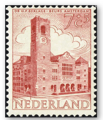
The Amsterdam Stock Exchange - designed by H.P. Berlage and built between 1896 and 1903

In the 1630s in the Republic of the United Netherlands people speculated with an unusual object - tulip bulbs.