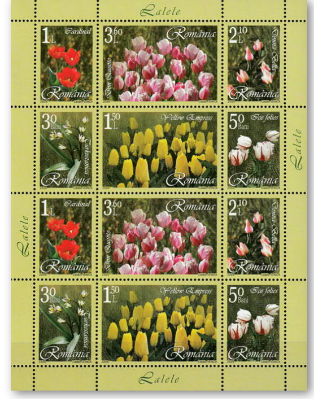
Just a small impression of the variety of tulips....

And . . . One hundred years ago, there was hyperinflation.