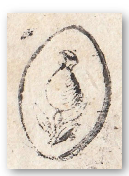
A so called "tulip" stamp was used to mark disinfected mail in Romagna (Italy)

After the surrender of Antwerp in the Spanish-Dutch War in 1585, the unprecedented rise of the Netherlands as a European trading power began. In 1602, the first joint stock company, the United East India Company (VOC), was founded. Innovations in shipbuilding led to a rapid increase in the Dutch merchant fleet, securing dream profits for shareholders from the spice trade. This period saw the establishment of the Amsterdam Wisselbank in 1609 and the opening of the world's first official stock exchange building in Amsterdam in 1613.